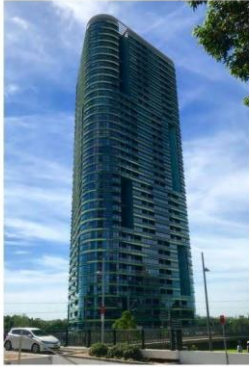
OPAL TOWER INVESTIGATION INTERIM REPORT