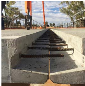
Gascoyne River Bridge - Humes