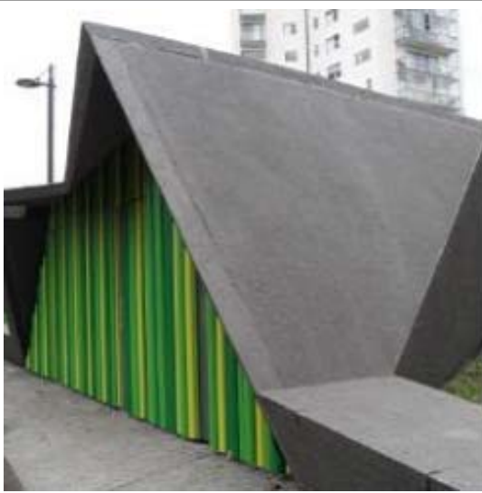
Princes Park Amenities - Duggans Precast