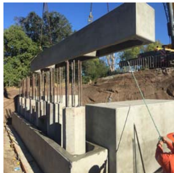
Poor Man's Gully Bridge - Stresscrete