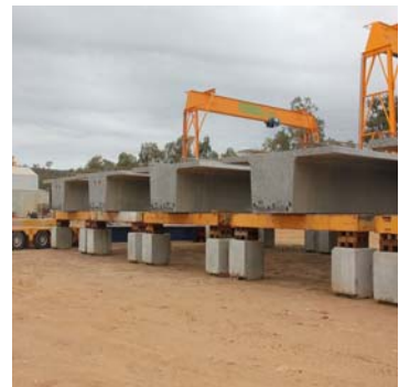
Mitchell Freeway Extension - PERMAcast